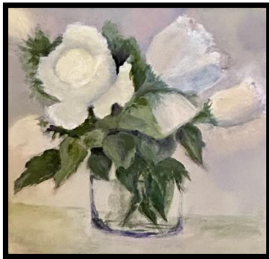
Florance Clements – Summer Harvest STILL LIFE AWARD