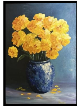
Gail Lovelady – Flying Free HIGHLY COMMENDED AWARD