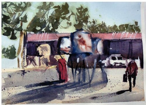
The Farm Yard – Leonie Moore (day two)