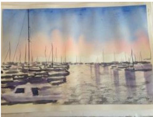
Harbour Sunset – Vic Fazakerley (day one)