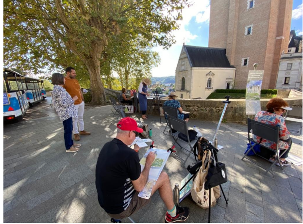
A study of concentration!

Wednesday was a day off, so we explored Pau, a beautiful clean city, and had a wonderful al fresco lunch, with more wine, the French rosé is wonderful. Thursday was portrait painting in the studio using reference material and in the afternoon one of the party volunteered to be a model. Friday was another plein air adventure to a local market with plenty of interesting subject matter.