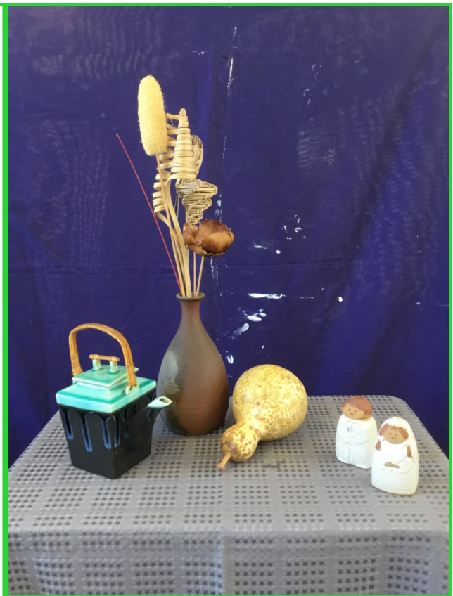
Working together to create a composition for still life

WATERCOLOUR WEEKEND 18th and 19th February 2023